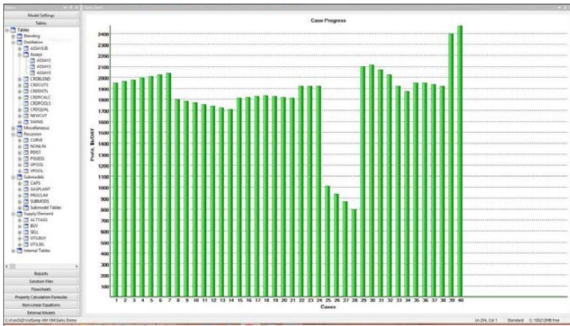
Run multiple cases dramatically faster with Aspen PIMS-AO.